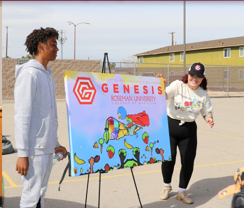
Committed to Community.